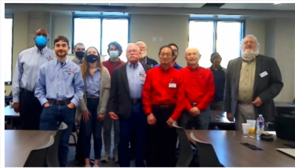
2022 Winter Planning In Person Attendees

Officers and others attended the CTS Winter Planning Meeting 1/22/2022 ↓