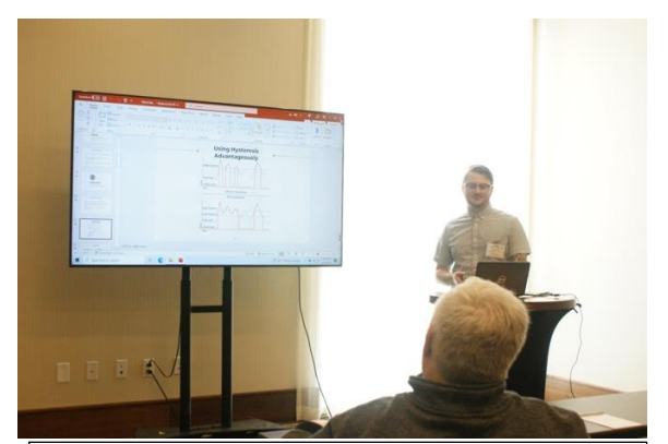
The competition is on...