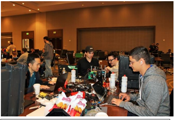
Prepping the gear...