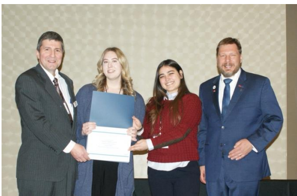
Third place was awarded to the Texas A&M-Corpus Christi team.