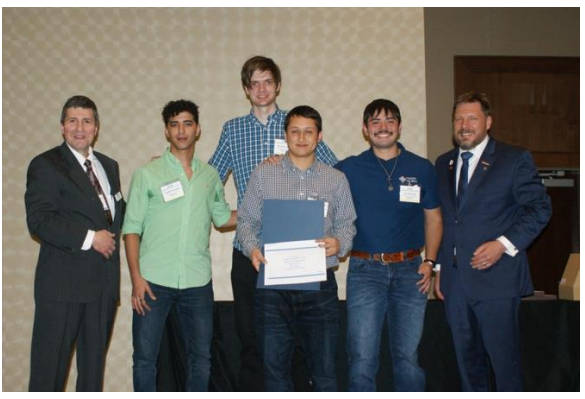
And first place, Round 2, went to the Null Nibble from St. Mary's University.

Graduating Seniors – The Graduation Class of 2023 was also recognized during the Awards Banquet with a token of recognition from Region 5.