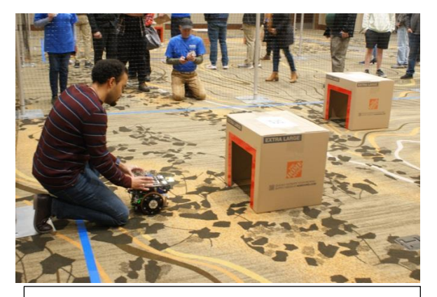
Ready to launch...