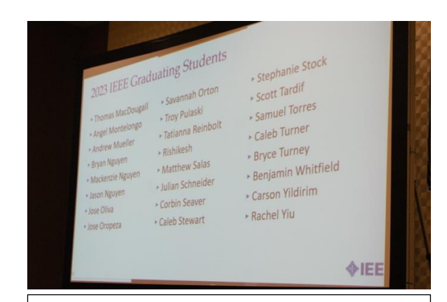
The roster of graduating seniors...

Graduating Seniors – The Graduation Class of 2023 was also recognized during the Awards Banquet with a token of recognition from Region 5.