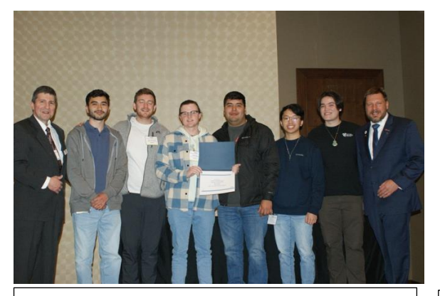
First place, Round 1, was awarded to the Panda Drone from The University of Texas – Arlington.